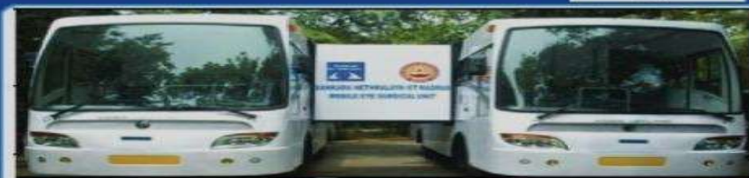
Eye operation vehicle